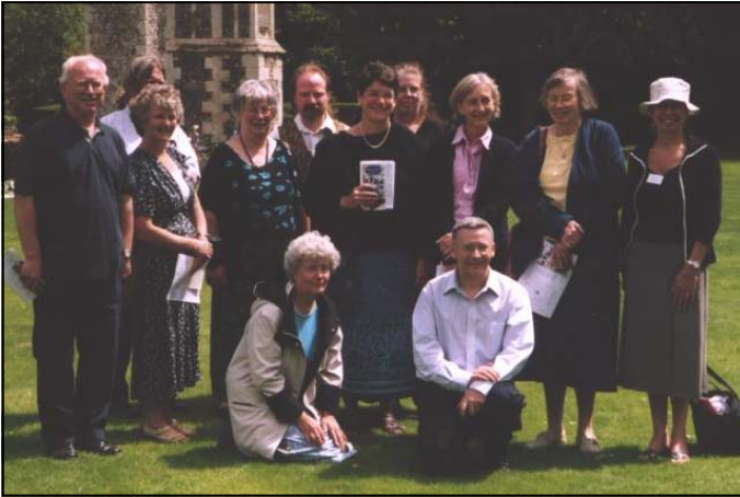
Members of the Group in the Abbey Grounds, Walsingham

Our East Anglian experience could almost be summed up as an “Interfaith Mystery Tour” or perhaps “Diversity is the Name of the Game”.