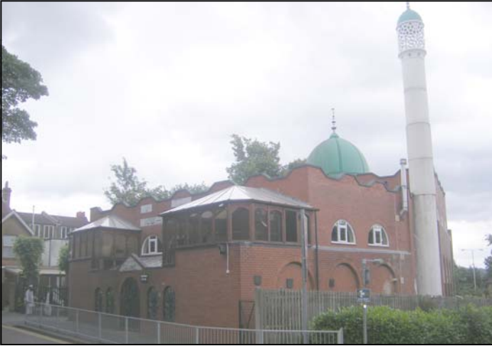
Above & right: Watford Jamia Mosque, a very active Muslim community, where we were shown round and then kindly provided with refreshments.