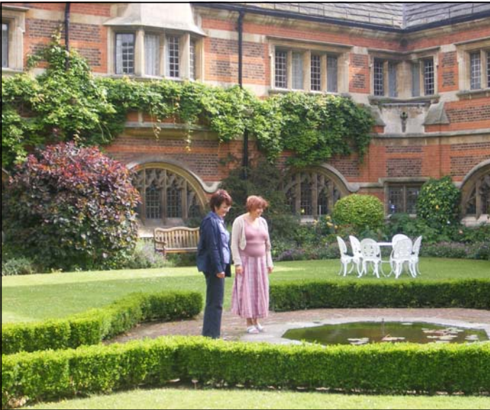
Above & right: Members of the group at London Colney.